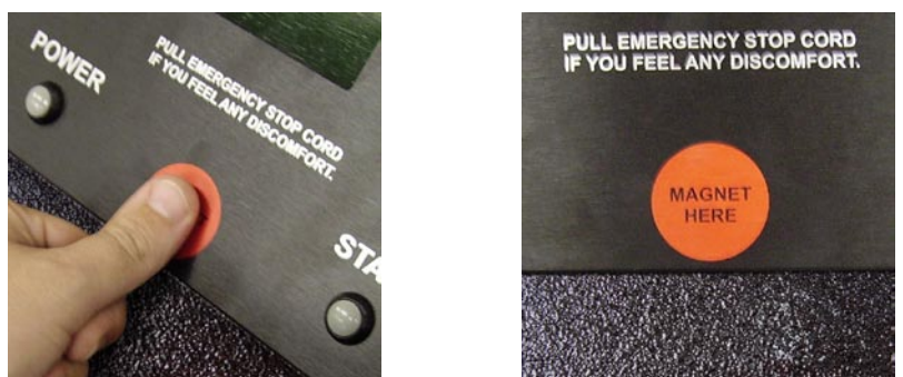
WHEN YOU FEEL THE KILL SWITCH PRESSING ON YOUR THUMB, STOP THREADING THE KILL SWITCH INTO THE HOLE.

6. Thread the kill switch into the display panel. Stop threading the kill switch when you feel it begin pressing on your thumb.